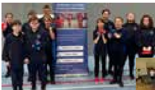
Table Tennis Club

The academy was well-represented by several students last week at the New Age Kurling SEN event, where they displayed exemplary behaviour and remained engaged throughout. Well done to all students who were involved.